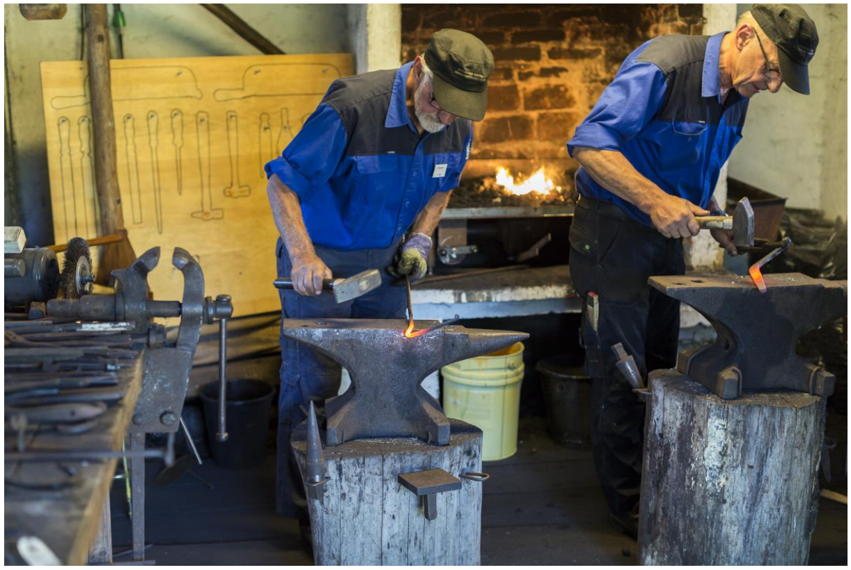
Volunteers at the forge of Ringkøbing-Skjern Museum