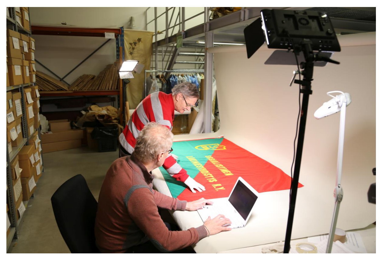
Volunteers recording a flag from the collections at Werstas.

were mentioned, as well as access to the museum's library, excursions to other interesting places (38) and also exclusive guided tours through the museum (35), training opportunities (34) and pre-views of new exhibitions (17). The latter three could all be subsumized under training for volunteers and thus double as lifelong learning activities. 19 also said their volunteers get a gift. Those who chose the "other" category explained for example that their volunteers' rewards depend on the volunteer group they are in. Some give gifts at special occasions like Christmas, or invite the volunteers certain times a year to a meeting with food and drinks that can be exclusively for volunteers or also for staff. One said their volunteer guides get free copies of publications and another specified that their volunteers are also part of ongoing research, which can be defined as lifelong learning activities. One said they pay their volunteers "mostly" (but left it open for which tasks, for example guiding", another said they pay the metro tickets for their volunteers to get to the museum. With regard to diversity strategies, this is particularly important for refugees who often live at the outskirts of cities and have a very low daily allowance that does not permit them to travel regularly, not even by public transport. To offer reimbursement for transport and food during the time at the museum can be crucial for attracting new groups.