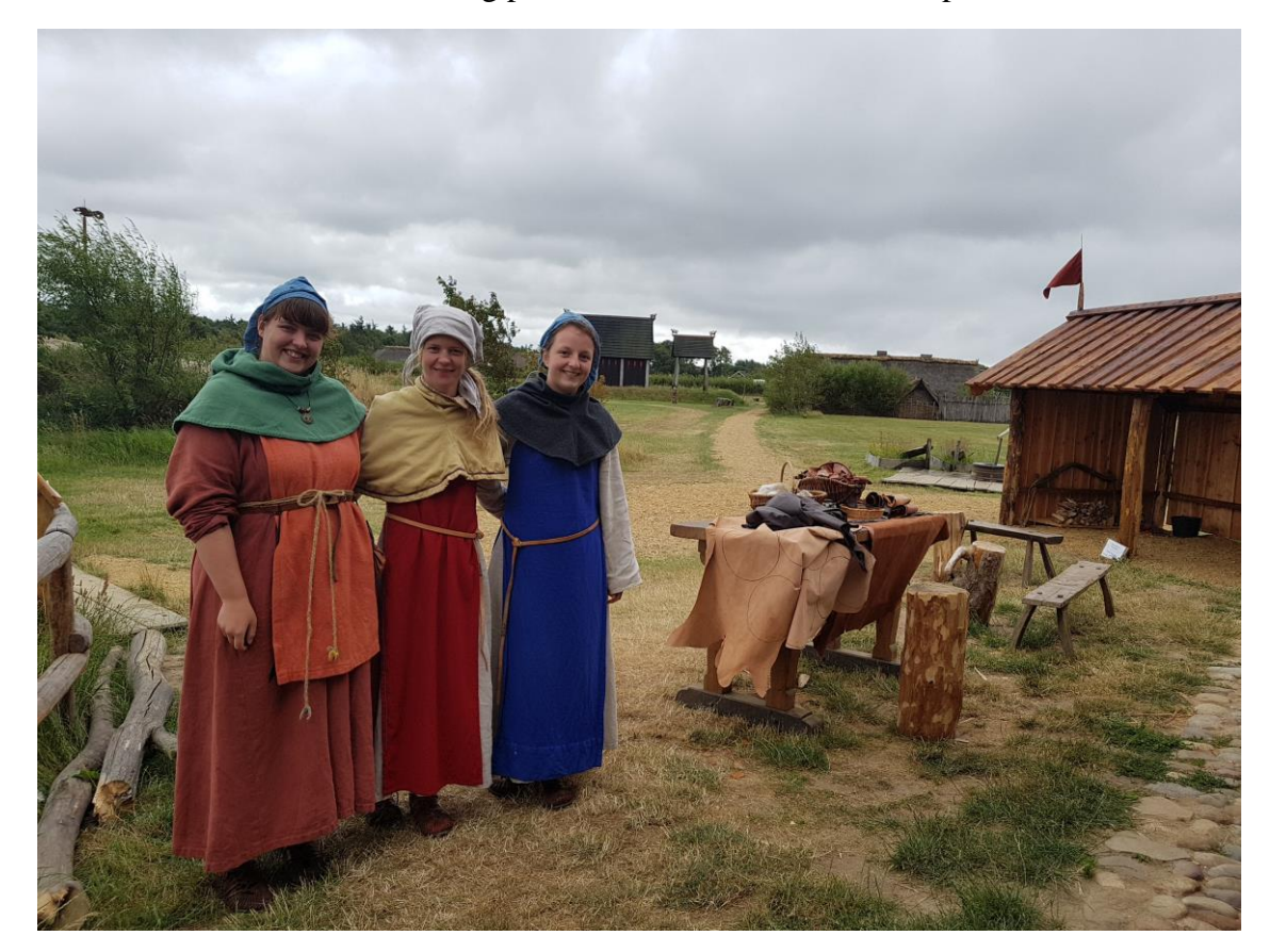
Volunteers at Bork Viking harbor in Denmark.

In the last question, everyone could give free feedback on the question which difference volunteers make to their museum. The answers were very positive and stressed the beneficial learning effects both for volunteers and the staff. They also gave good examples for work areas where the responsibilities of employed staff and volunteers complement each other and do not interfere, for example the volunteers' support at huge events or during the main season in open air museums, also as actors in costumes, their help with extended opening hours, their valuable work and life experience, especially when they are seniors, their enthusiasm in greeting visitors that makes the museum a welcoming place and also attracts different part of communities.