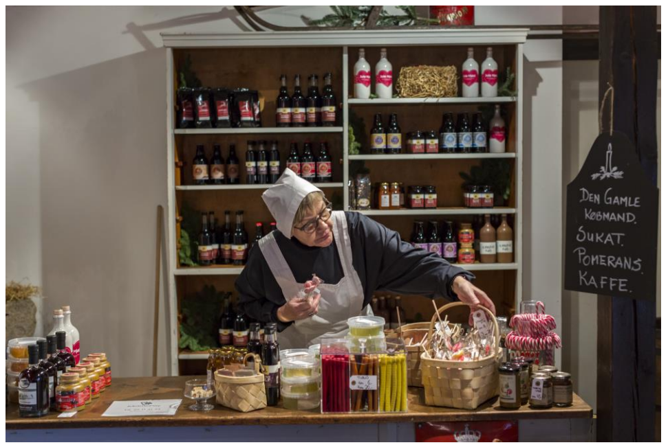
Christmas time at Bundsbaek Mølle in Danmark with the volunteers

From the 137 persons who answered the question how long the volunteers usually stay active at their museum, the overwhelming majority (91%) said "for years", while only 7% said "for some months" and 2% "only once or a few times". This result confirms the already mentioned study "Pride, Joy and Surplus Value" that showed that most of the volunteers are seniors who are active in a museum over many years. That also means that younger persons with very limited time to dedicate to volunteering activities can find volunteering at museums unattractive because it is not flexible enough to fit into their busy lives. Interestingly, two of the three museums who had such short-term volunteer option came from Finland, and the third from Sweden. Though the numbers are by no means high enough to be generalized, they might underline the volunteers for some months, the Swedish museums show. Among those museums that had volunteers for some months, the Swedish museums were in majority. The reason may be that many small museums need additional hands through the summer season.