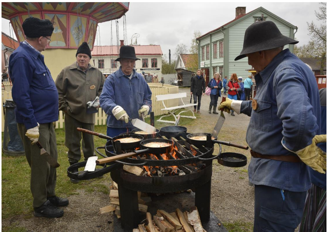
Volunteers at Jamtli Museum preparing delicious food