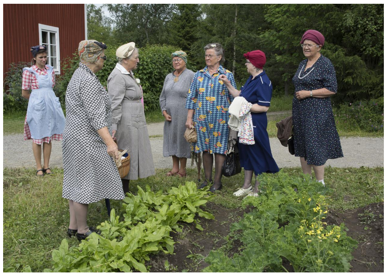
Volunteers at Jamtli Museum Östersund, Sweden