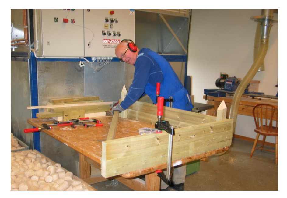
A volunteer at Sverresborg/ Museums in Sør-Trøndelag builds crates for herbs in support of the museum's garden group