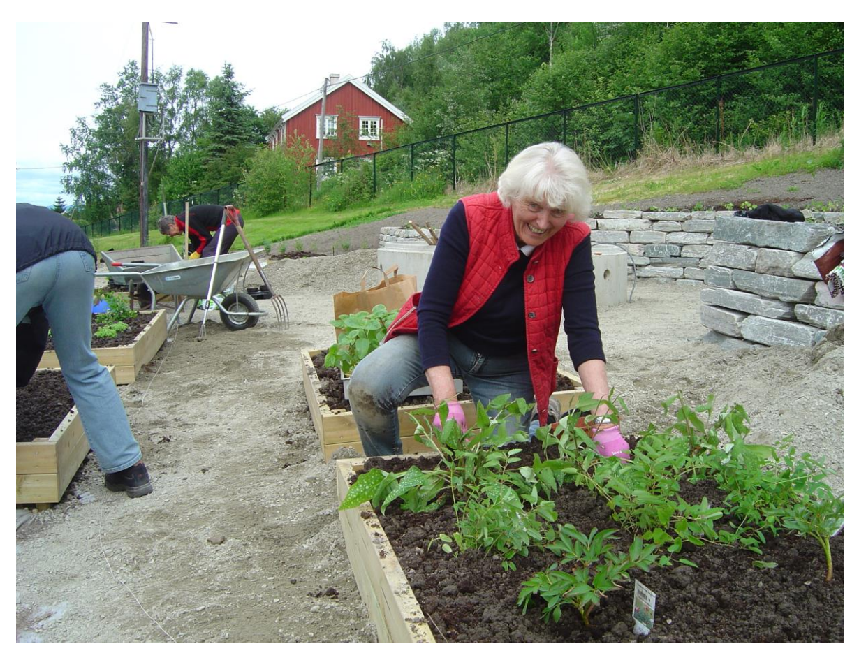
The garden group at Sverresborg / MiST.