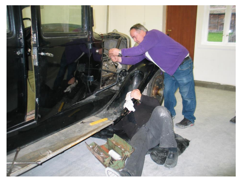
Volunteers at Sverresborg / MiST restoring veteran cars.